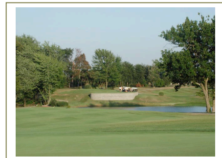
9 th Hole Tee Box

Eighteen holes of match or medal play will teach you more about your foe than will 18 years of dealing with him across a desk. ~Grantland Rice